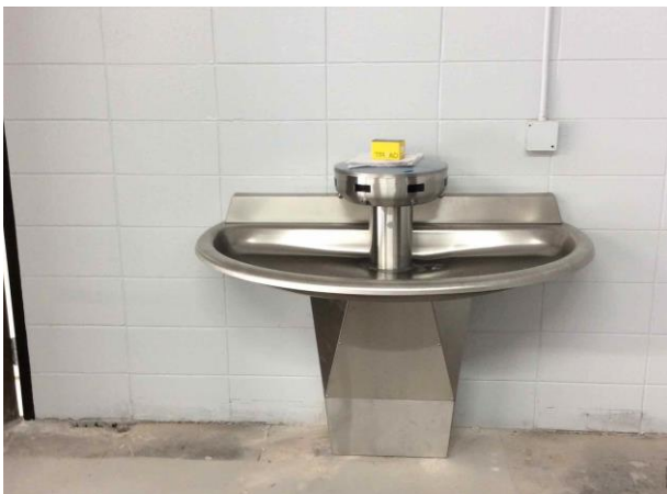
Tech Ed Room Sinks